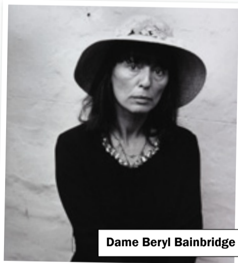
Dame Beryl Bainbridge